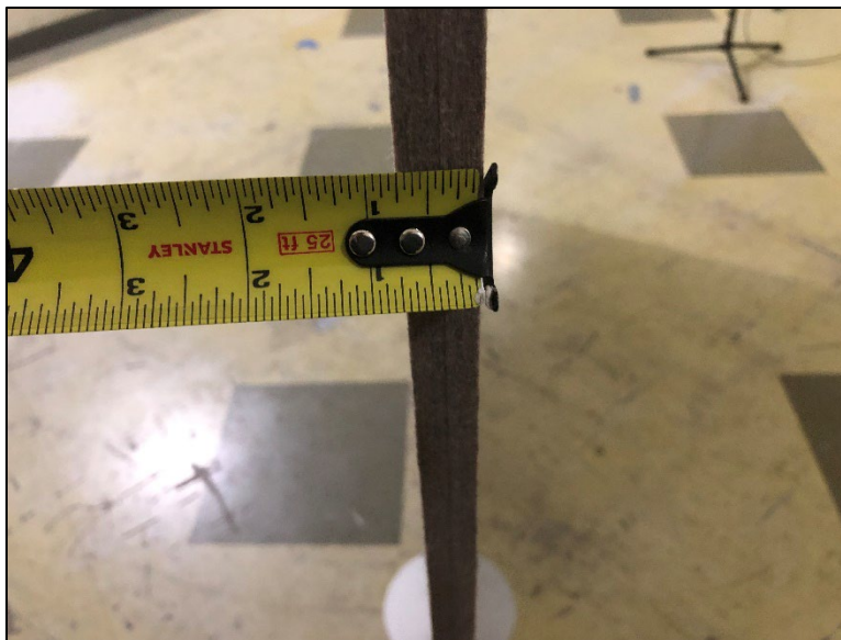
Photo No. 2 Side View of Test Specimen