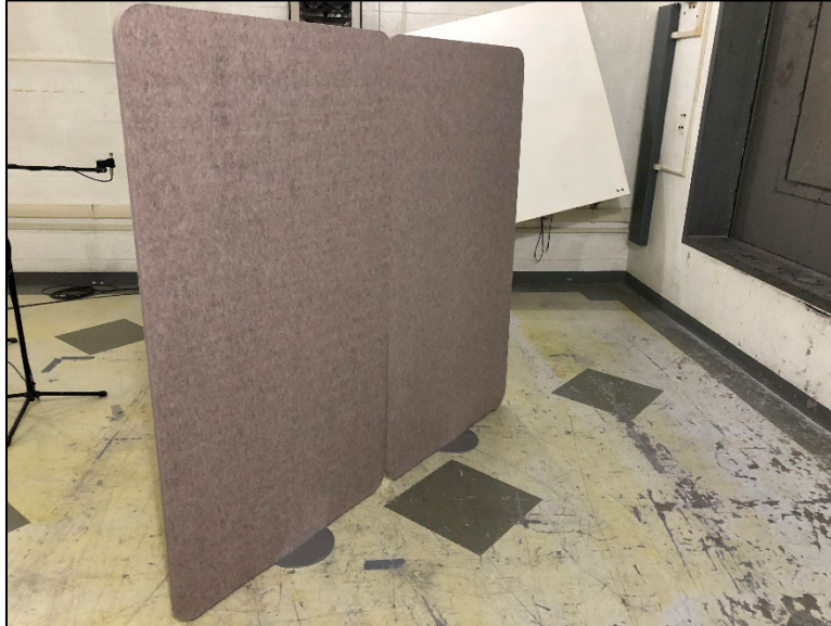
Photo No. 1 View of Installed Test Specimen