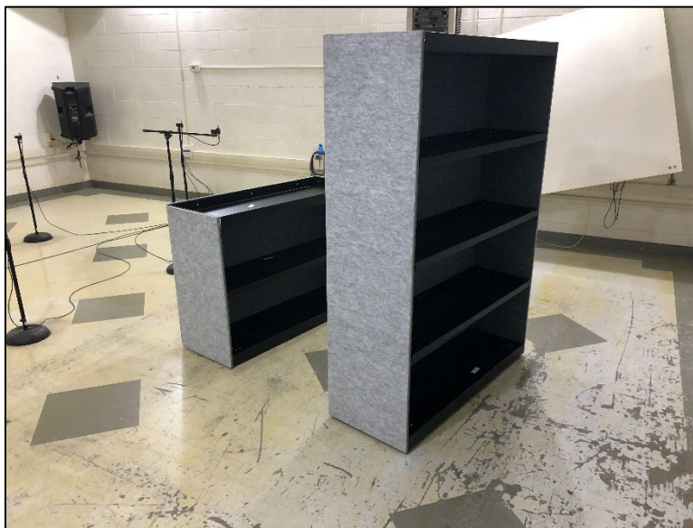
Photo No. 1 View of Installed Test Specimen