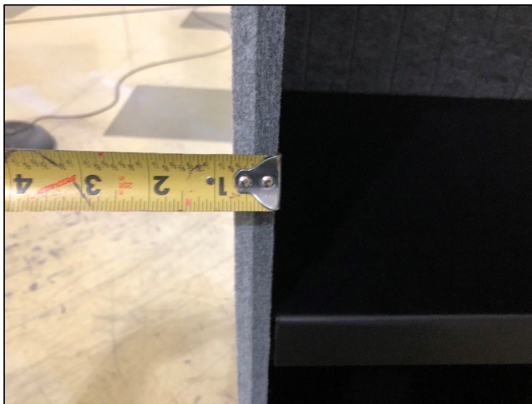
Photo No. 2 Side View of Installed Test Specimen